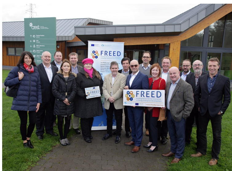
Fig 4— FREED Partners and companies in Enniskillen for the last Partner Meeting