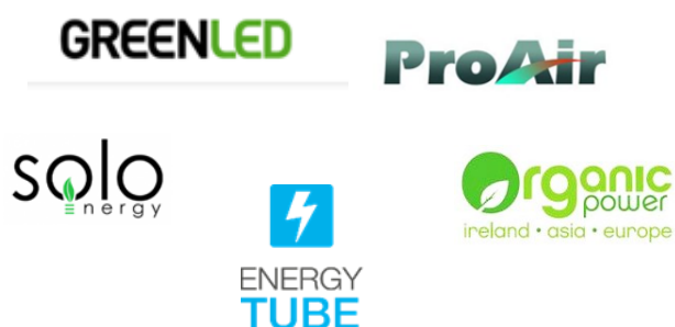
Fig 3 — Supported companies

More details and testimonials are available from FREED's website.